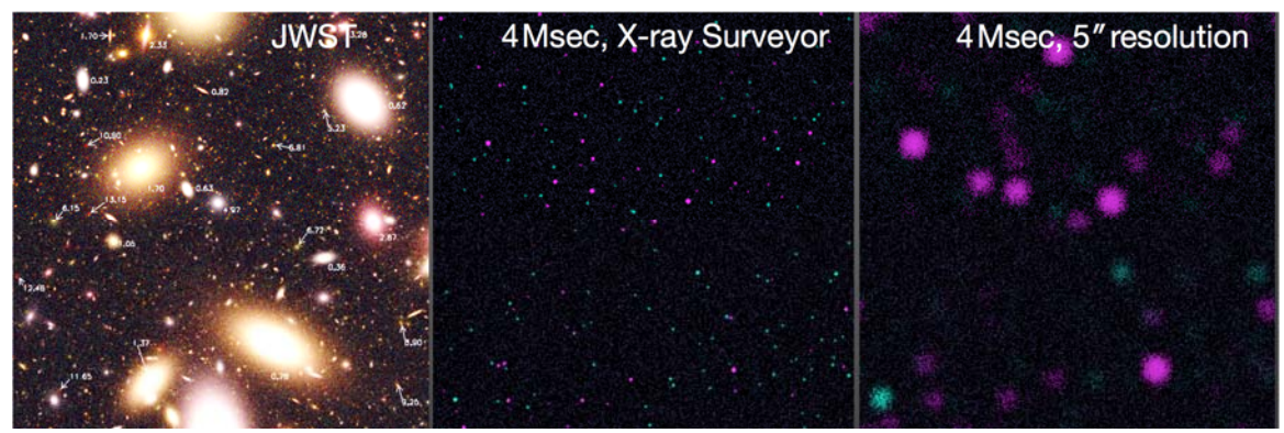
Figure 1 Simulated Deep Fields with JWST (left) and X-ray Surveyor (Center). Each is 2 arcmin on side. JWST detects \sim 2 x 10^6 galaxies deg ^2 . X-ray Surveyor resolves these without confusion (0.03 galaxies per 0.5" beam ). A 4 Ms X-ray Surveyor exposure (same as the Chandra Deep Field) detects a 10^4 M<sub>sun</sub> black hole at z=10 (Lx 10^{41} erg s ^{-1} ). A telescope with the same area but 5" resolution (right) is confusion limited at this depth. AGN are shown in magenta; normal galaxies in green. [Gaskin, et al. 2015].

X-ray Surveyor will also probe the host galaxies of the M \sim 10^9 M<sub>sun</sub> black holes powering z \sim 6 -7 Sloan quasars. These must be the most massive galaxies, and hence reside in the most massive dark matter halos (M \sim 10^{12} M<sub>sun</sub>) to have collapsed by that epoch. The expected X-ray luminosity of the hot halo gas surrounding one of these galaxies is only a small fraction of the quasar's, and X-ray Surveyor's angular